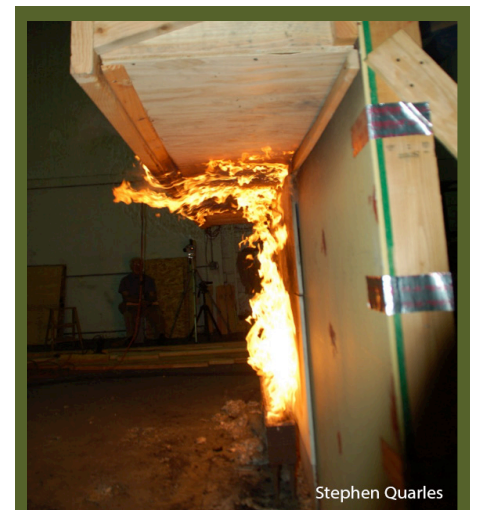
Lateral flame spread was reduced when a combustible soffit material ignited in this test of a soffited-eave with a combustible soffit material.