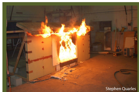
Flame impingement exposure to the underside of the eave, and time-to-ignition of the joists, blocking and fascia was quicker; and lateral flame spread faster, when an open-eave design was used in research experiments.