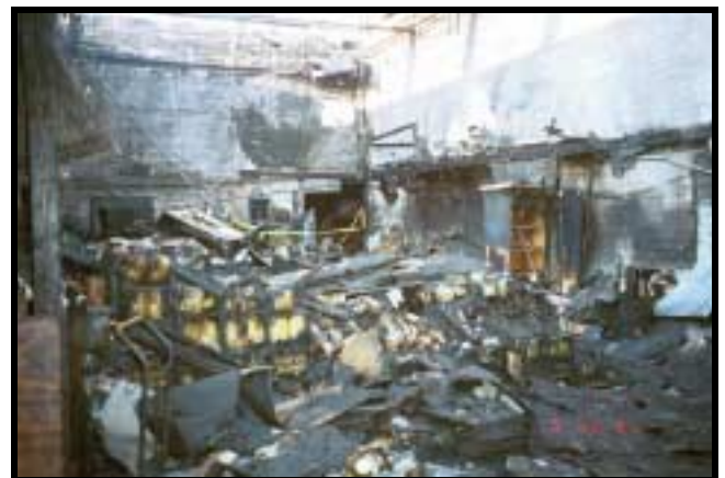
View of supermarket stock room

Visibility was reported to be worsening as Engine 14 advanced their hoseline. One fire fighter from Engine 14 reported his low-air alarm was sounding, and he was exiting the building. The Captain of Engine 14 directed the fire fighters to exit the building as a team. At this point, another of Engine 14's crew low-air alarm was sounding. During the crew's exit, two fire fighters and the Captain lost contact with the hoseline. The Captain was able to again gain contact with the hoseline and exit the building. Outside he met with one of Engine 14's fire fighters, who informed him that the other two members of the crew had not exited. It was at this point that the first distress call was heard from one of the lost fire fighters.