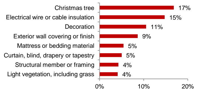
Leading Items First Ignited in Holiday Light Home Structure Fires

Falls are also a problem. A study found that roughly 5,800 people per year were treated at hospital emergency rooms for falls associated with holiday decorations during November to January. 2